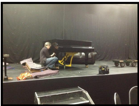
Picture left shows tilter leg extended for bass leg fitting.